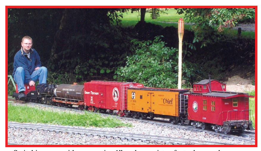
Switching cars with a very nice 1" scale consists of a tank car, a box car, a refrigerator car and a caboose.