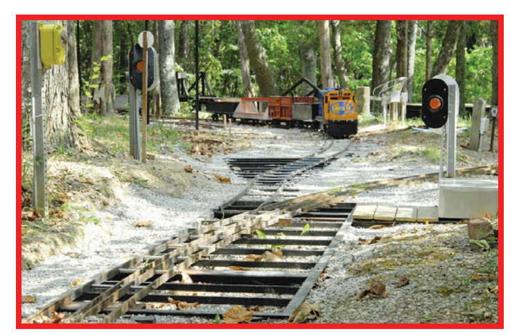
The new yard track with the Santa Fe GP38 parked with a train on it during the August run.