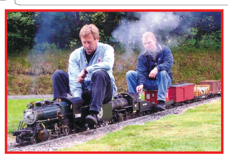
Double heading German style using a mogul and an 0-6-0 switcher. A very nice group of cars.