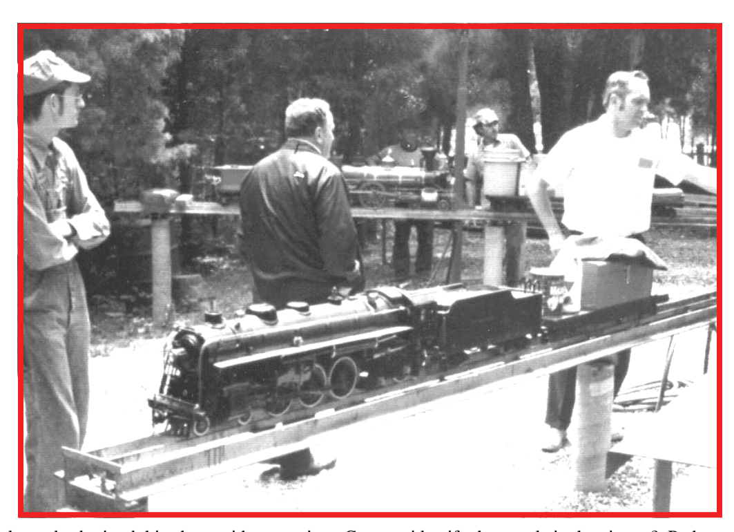
Lou Lockwood submitted this photo with a question. Can you identify the people in the picture? Perhaps the engines will help with the identification ...

If you have pictures from our track or others that you'd like posted, send them in. Thank you.